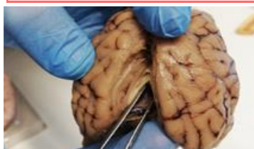
The sheep brain being dissected

We would like to thank The Cavalier pub in Northfield for their ongoing support. Not only do they collect money for us on a regular basis by having one of our collection tins at their pub, they also held a Charity Fun Day in the autumn, raising a whopping £1,000 towards our local brain injury services. Thank you again from everyone at Headway Birmingham & Solihull.